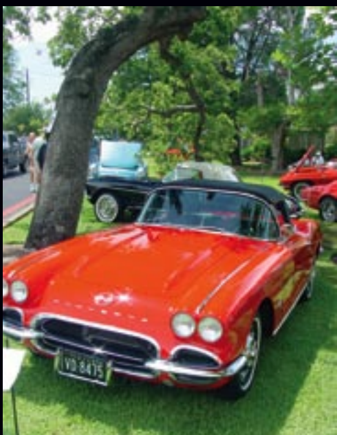
Something for everyone from antiques and classics to Corvettes – K&W leaves no one wanting for a favorite car.